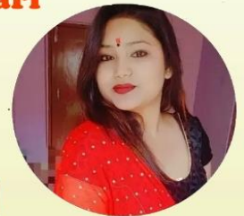
BBA, Batch (2018-21)