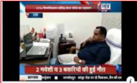
YOUTUBE.COM TV News coverage on the Inauguration of ICFAI COVID Care Portal