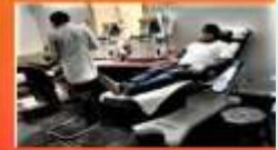
Donor from Gumla donating AB(-ve) plasma

“ Yet , another instance of the ICFAI University's Caring and demonstration of the Human Values of its Students... ”