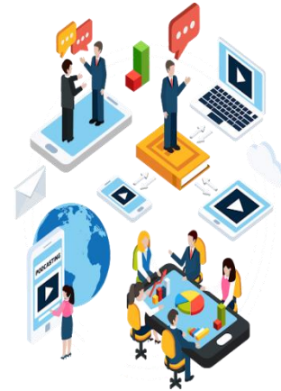
(Facilitate Learning )

Students involved in the learning process