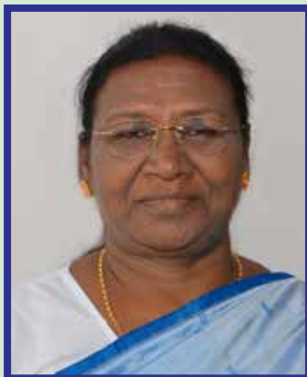
Hon'ble Her Excellency Draupadi Murmu The Governor of Jharkhand