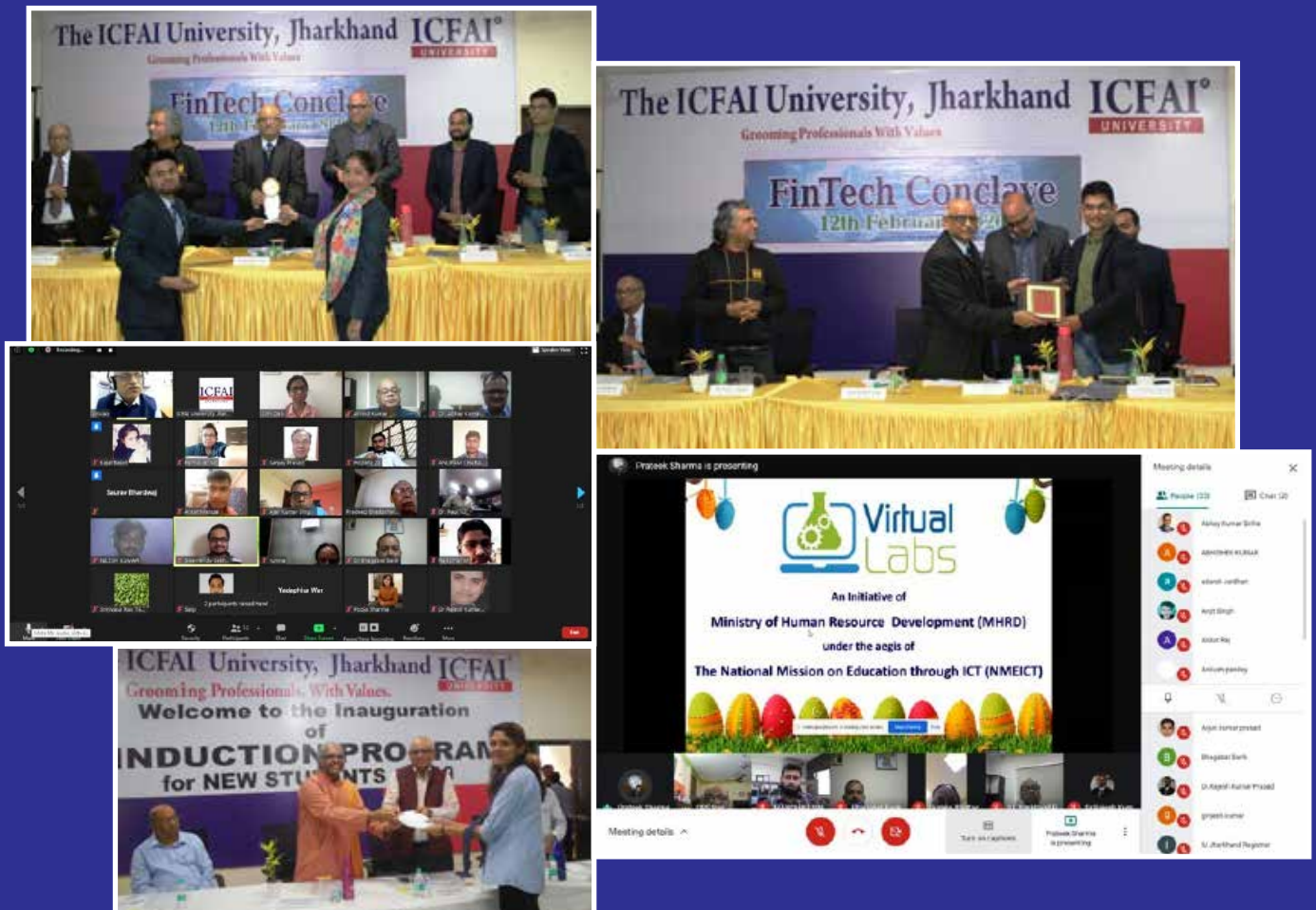
Glimpses of various programs conducted by the University