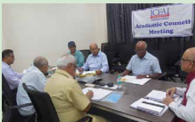
Academic Council Meeting