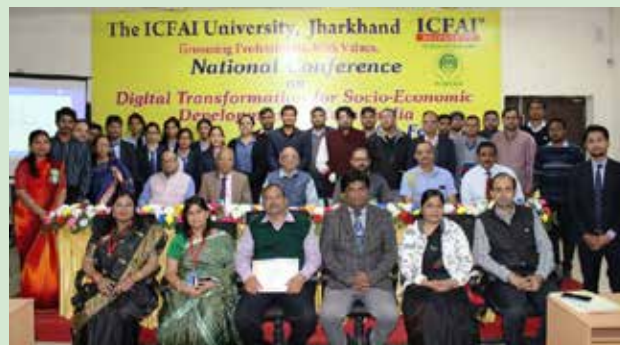
Conference on Digital Transformation of Rural India