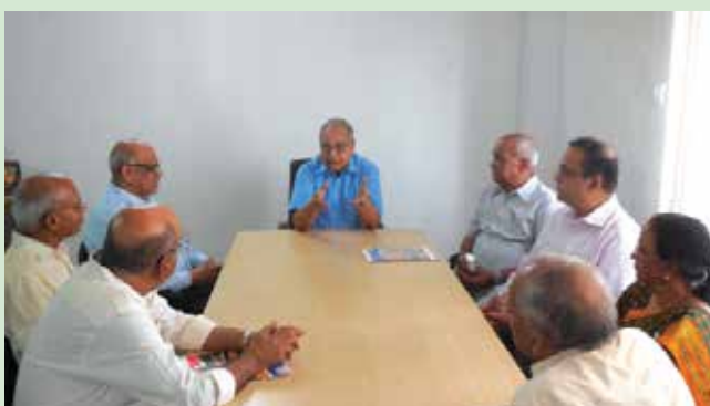
Chancellor with the Senior Management Team