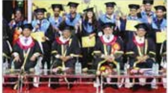
कुल 198 डिग्रीधर्ी में रांची विवि