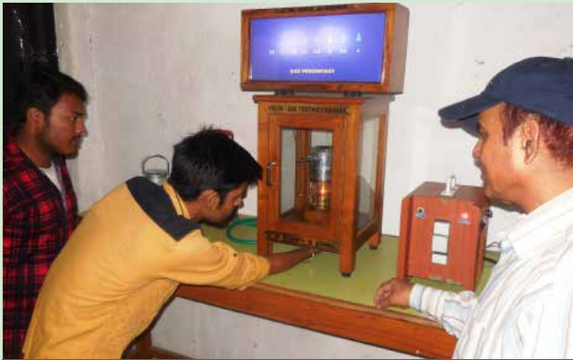
Gas Testing Facility in Mining Lab

b) Microprocessor Lab: Provides experimental facilities required for Measurement Techniques course of B.Tech Program.