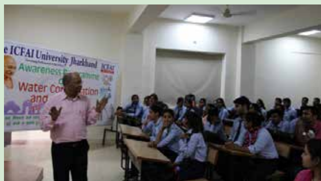
150 th Birth Anniversary Celebrations of Mahatma Gandhi