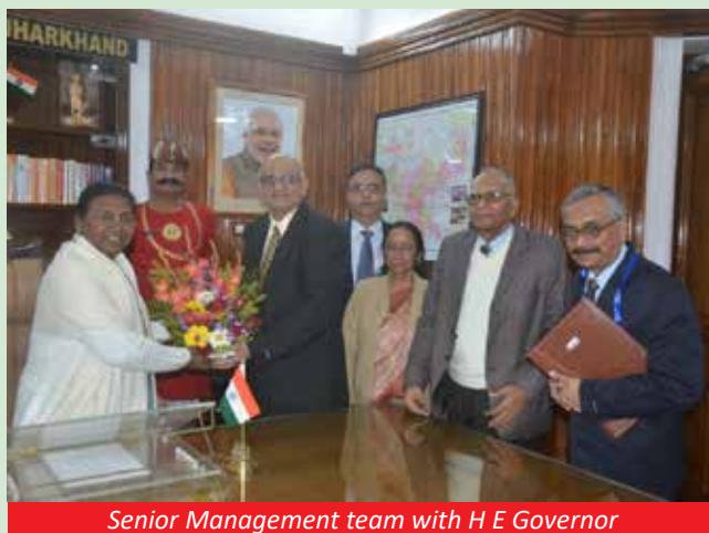
Senior Management team with H E Governor

Motto: Grooming Professionals. With Values