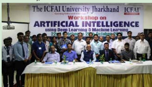
AI ML Workshop