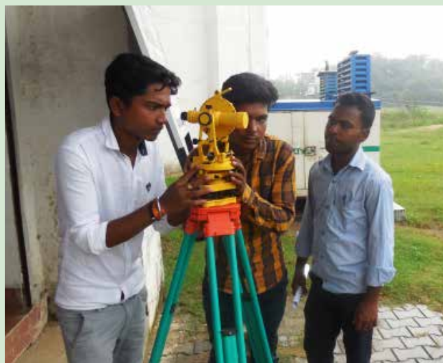
Mining Students using Survey Instruments