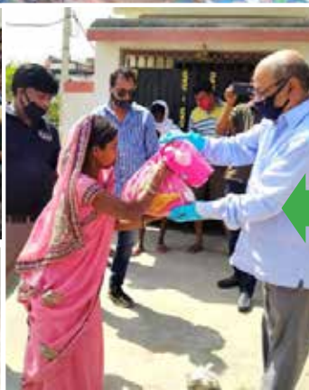
ICFAI University Employees distribute Bhojan Paatra Food Kits to poor villagers