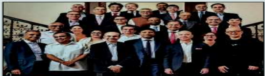
ELITE CLUB: Amazon CEO Jeff Bezos with industry leaders on Friday

Amazon founder and CEO Jeff Bezos on Wednesday had said he will invest $1 billion to digitise small and medium businesses and export 'Make in India' goods worth $10 billion to the e-tailer's global markets by 2025. Amazon said it has created 7,00,000 jobs in India already directly and indirectly over the last six years and the total jobs created by the local arm would stand at 1.7 million by 2025. The direct jobs created by Amazon in India stand at over 60,000. "We've seen huge contributions from our employees, extraordinary creativity from the small businesses we've partnered with, and great enthusiasm from the customers who shop with us — and we're excited about what lies ahead," said Bezos. His comments are of signi-