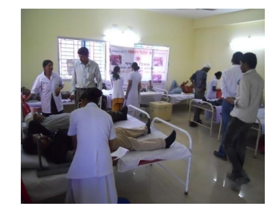
Blood Donation room