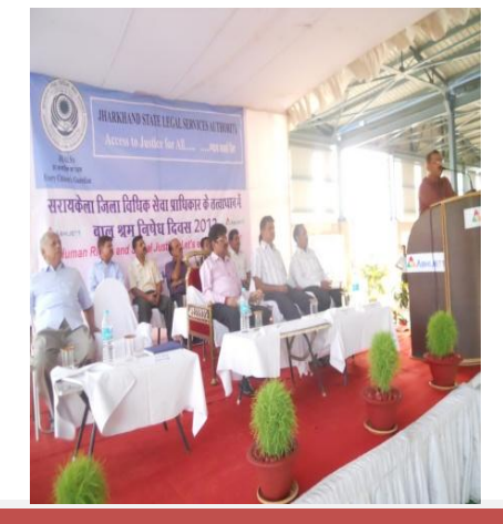
Guests during the program