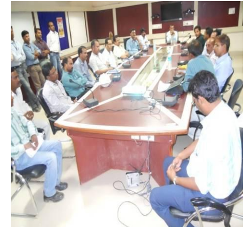
Group discussion of HODs on environment safety