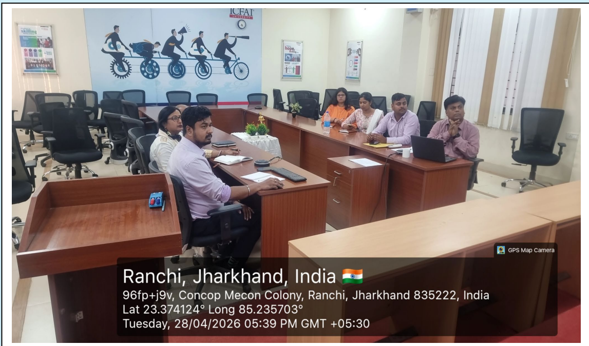
Ranchi, Jharkhand, India 🇮🇳 96fp+j9v, Concop Mecon Colony, Ranchi, Jharkhand 835222, India Lat 23.374124° Long 85.235703° Tuesday, 28/04/2026 05:39 PM GMT +05:30