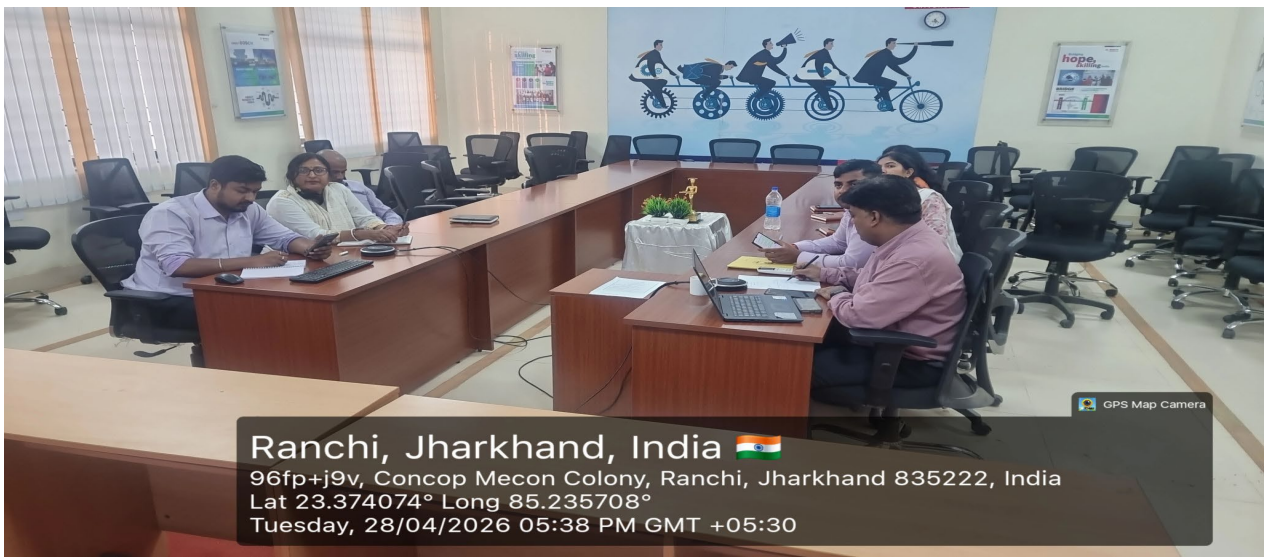
Ranchi, Jharkhand, India 🇮🇳 96fp+j9v, Concop Mecon Colony, Ranchi, Jharkhand 835222, India Lat 23.374074° Long 85.235708° Tuesday, 28/04/2026 05:38 PM GMT +05:30